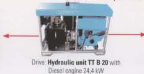
Drive: Hydraulic unit TT B 20 with Diesel engine 24,4 kW