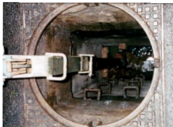
Winch boom lowered into the pit

A pipe bursting machine GRUNDOCRACK is pulled through the defective pipe. Its dynamic impact energy bursts the old pipe and displaces the fragments into the surrounding soil. A new pipe, either the same size or larger, is pulled in simultaneously.